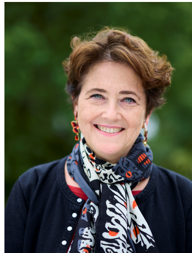
Professor Edith Heard Director The Francis Crick Institute

A blue ink signature of Professor Edith Heard.